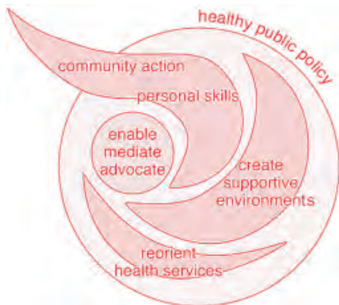
Figure 1: The Ottawa Charter